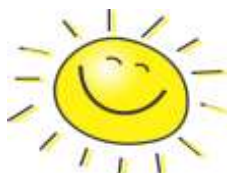
Trabzon Sunny 20 °C