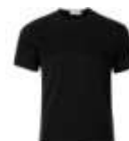
Black T- shirt (10 $)

The black T-shirt is.....(cheap) the blue T-shirt.