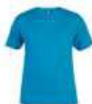
Blue T-shirt (15 $)

The blue T-shirt is .....(expensive) the black T- shirt.