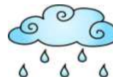
Gümüşhane Rainy 10 °C