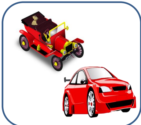
Old X New