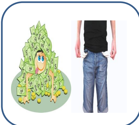
Rich X Poor