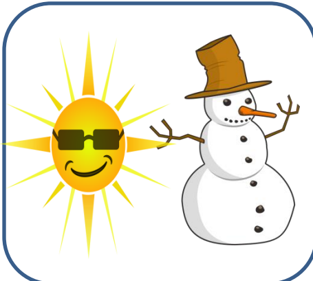
Hot X Cold