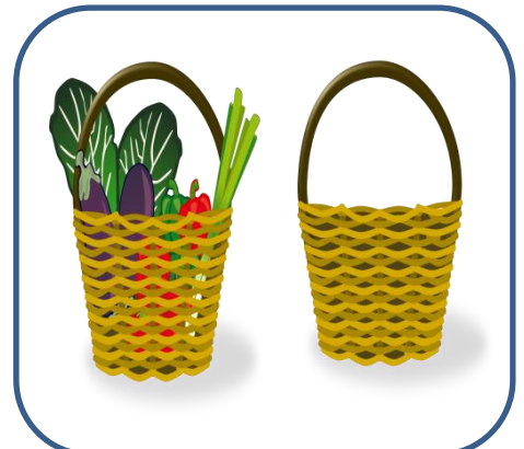
Full X Empty