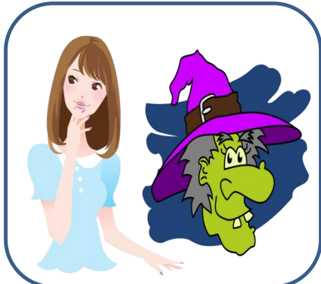
Beautiful X Ugly